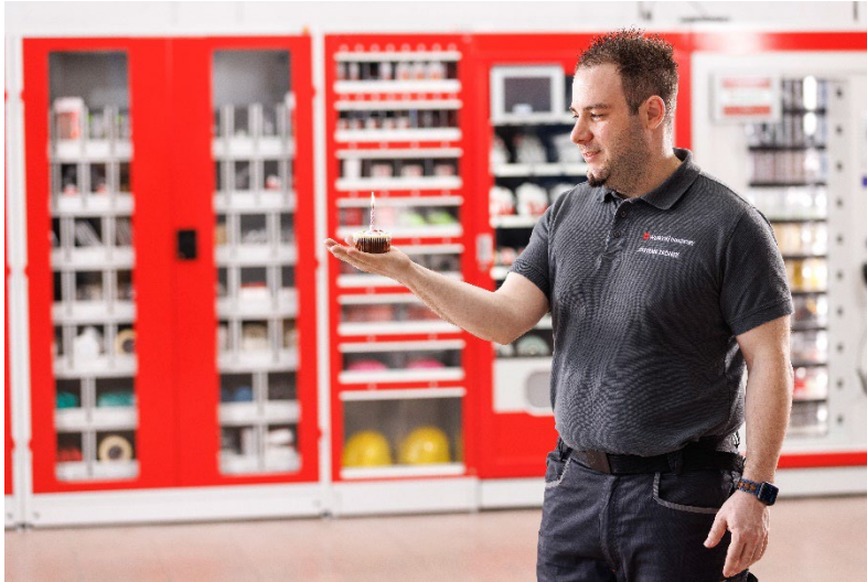
Photo 1: 10-year anniversary of ORSY@mat.jpg

Caption 1: Würth Industrie Service is celebrating the 10th anniversary of ORSY@mat vending machines.